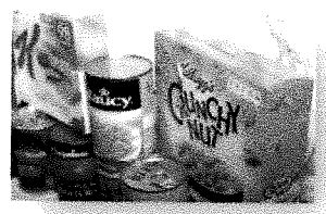
Stirling Food Bank